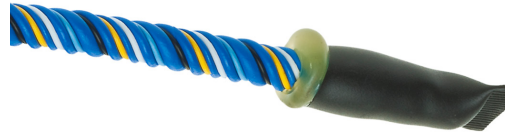
FG-ECS Sense Cable End Termination Tip

2 Communication Wires and 2 Wires for Locating